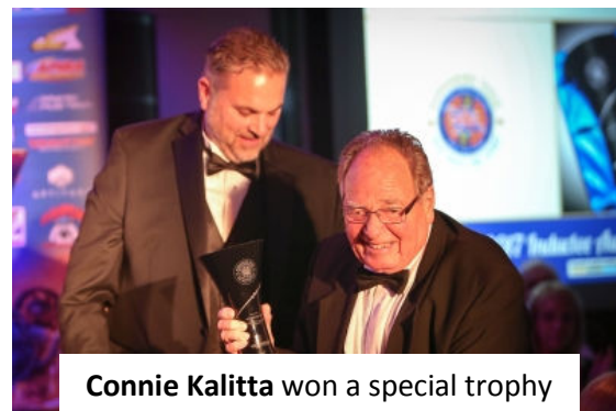
Connie Kalitta won a special trophy for his contribution to drag racing