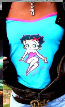
See you later...