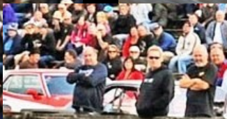
What better way to remind fans nostalgia drag racing is fun than match a babe in boots with a blower car!