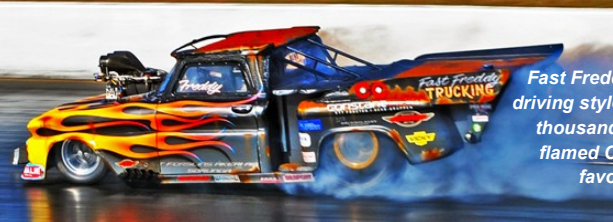
Fast Freddy Fagerström's balls-out driving style and regular tyre-churning thousand foot burnouts make his flamed Chevy Pro Mod pick-up a favourite with race fans