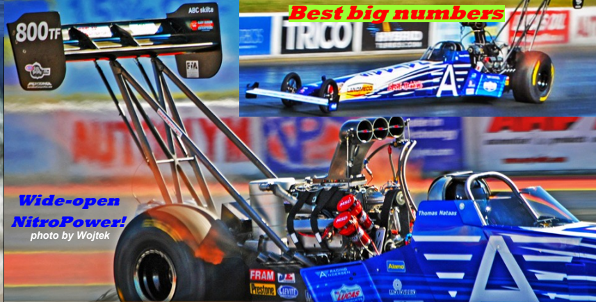
4.01 at 301.95mph Best big numbers

At the Shaky County Hot Rod Drags it was strictly "bring your own nitro" - but cars like this Wild Willys gave us wall-to-wall burnouts, thrilling fans of all persuasions