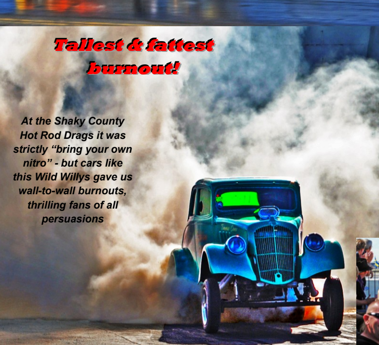
Tallest & fattest burnout!

At the Shaky County Hot Rod Drags it was strictly "bring your own nitro" - but cars like this Wild Willys gave us wall-to-wall burnouts, thrilling fans of all persuasions