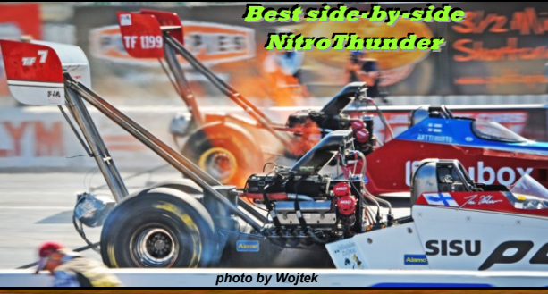
Best side-by-side NitroThunder