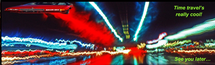
Time travel's really cool!