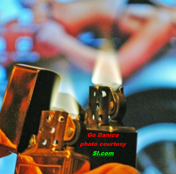
Go Danica