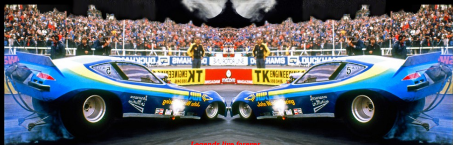
Legends live forever...