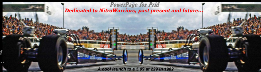
A cool launch to a 5.99 at 229 in 1982