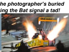
The last Saturday night quarter mile was Timo Lehtimäki's in 2011

2014 Main Event Photos by Wojtek Courtesy Lucas Oil Racing fine-tuned by mc