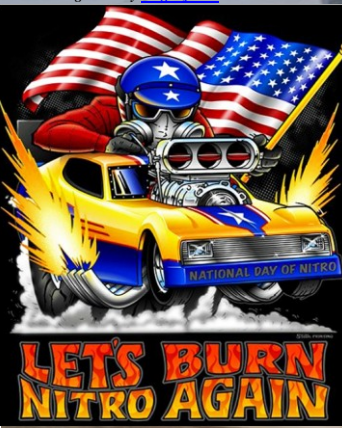
T-shirt image courtesy bangshiff.com