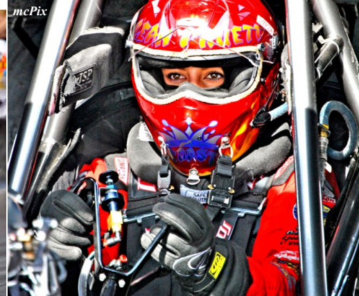
3.631 at 332.84!