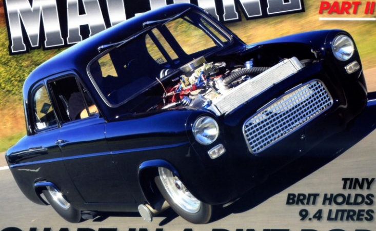
TINY BRIT HOLDS 9.4 LITRES