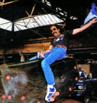
Hope you enjoy the ride folks...